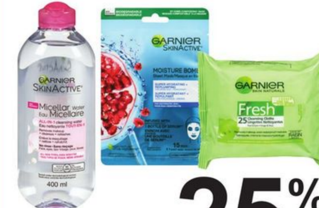
Garnier SkinActive Face Care