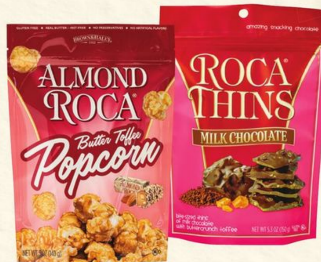
B&H Roca Popcorn 140 g or Roca Thins 150 g