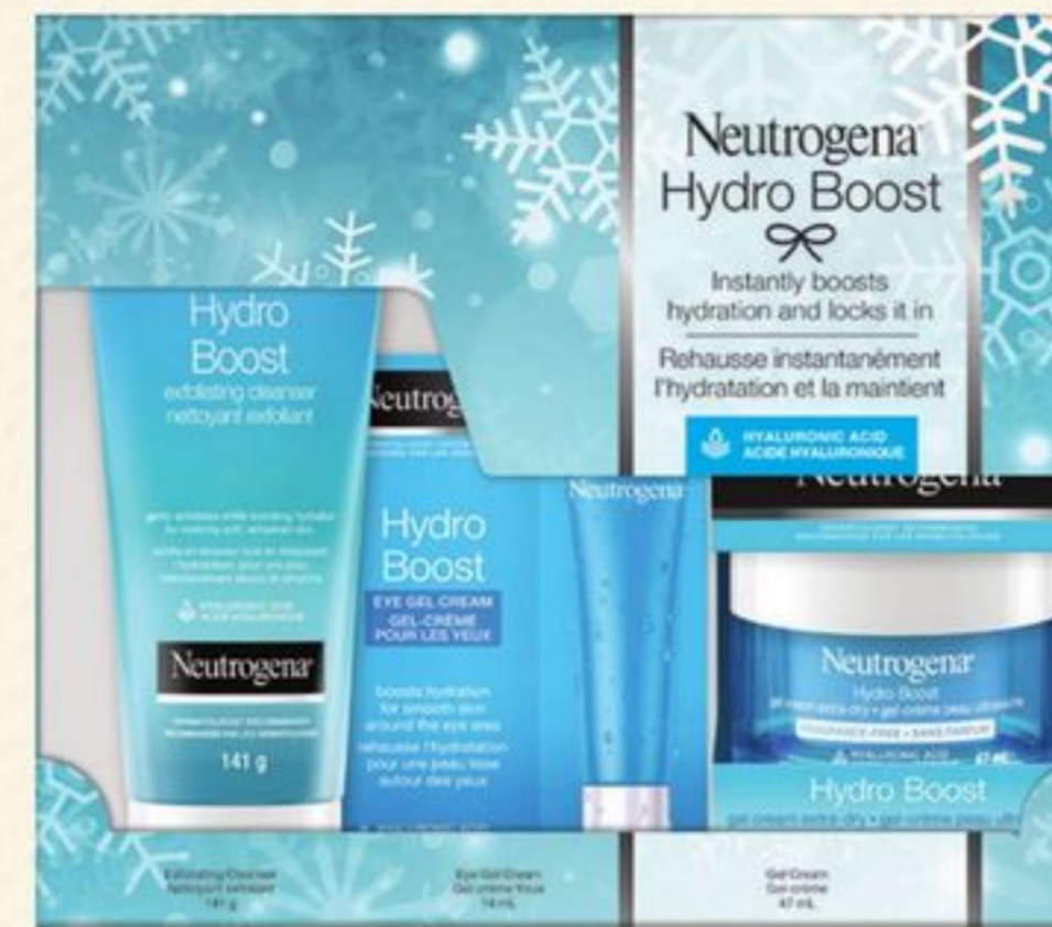
Neutrogena Hydro Boost Holiday Set