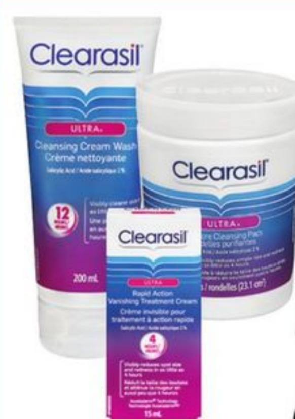
Clearasil Acne Care Products