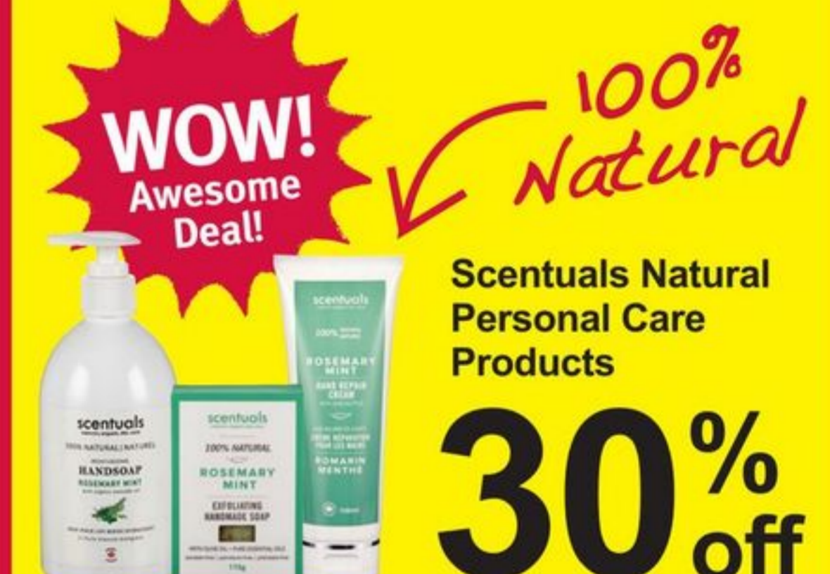
Scentuals Natural Personal Care Products