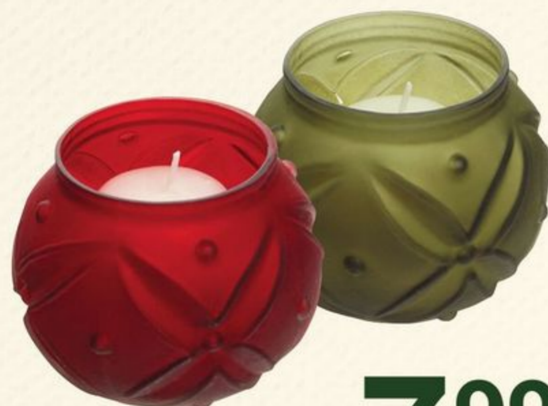
Frosted Glass Votive 3"