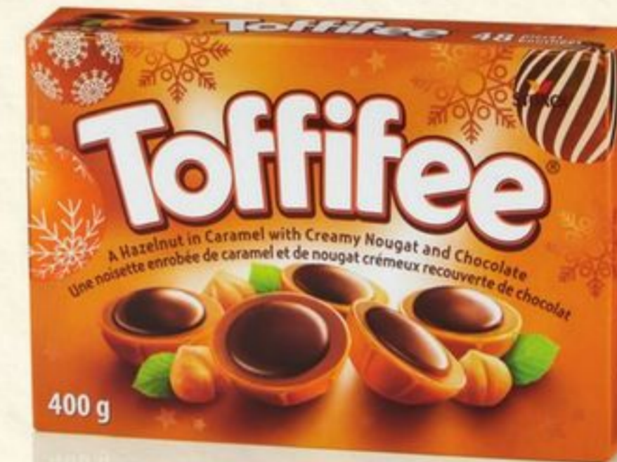
Toffifee 400 g or 3 x 123 g