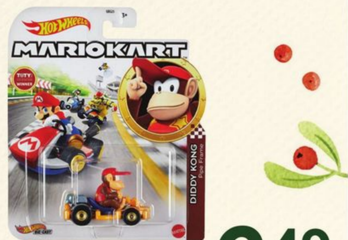
Hot Wheels Mario Kart Die Cast