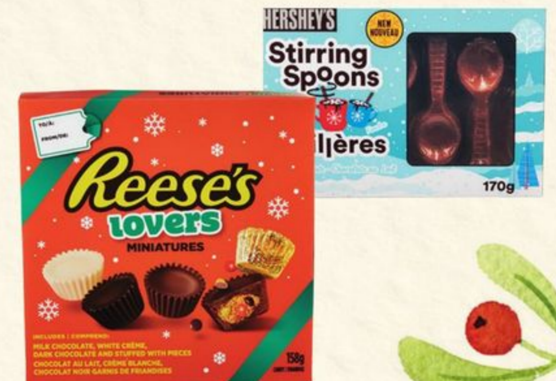
Reese's Lovers Miniatures Gift Box 158 g or Hershey's Stirring Spoons 170 g