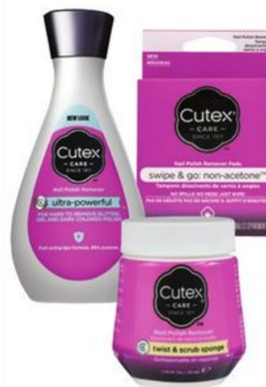
Cutex Care Products