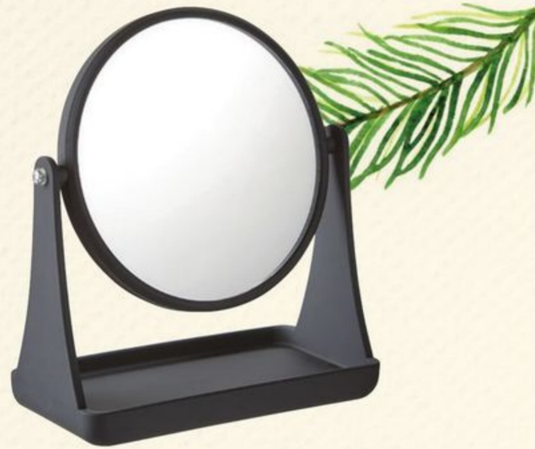
Danielle Soft Touch Round Vanity Mirror with Organizing Tray