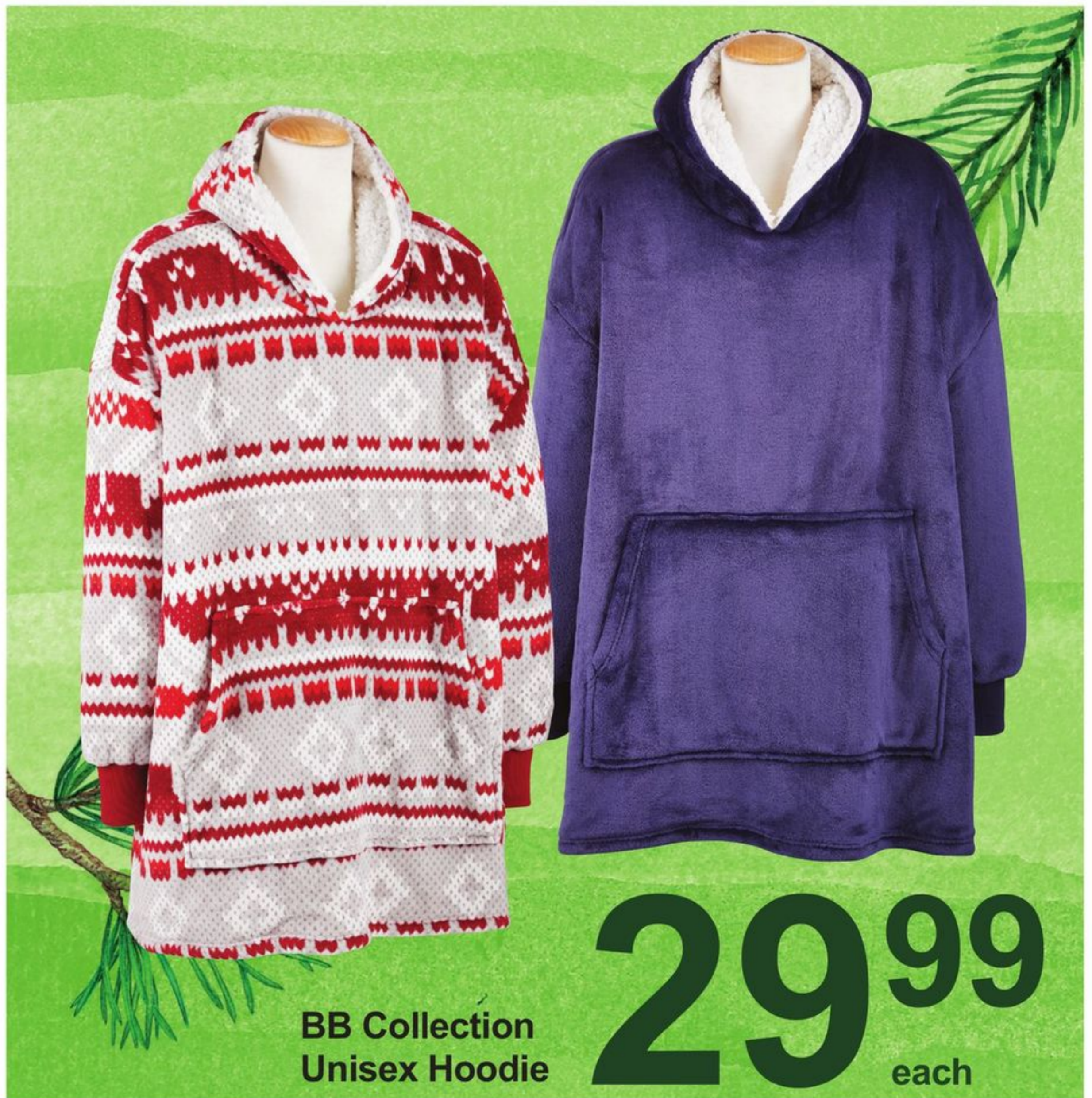
BB Collection Unisex Hoodie