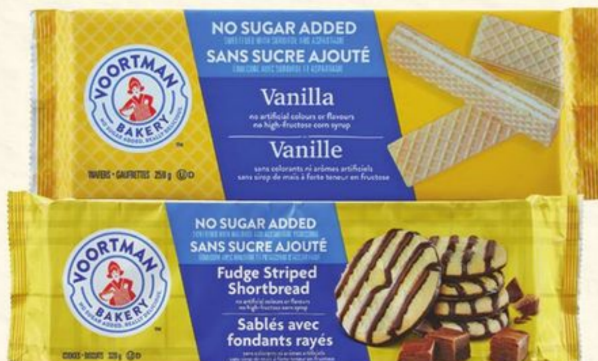
Voortman NSA Cookies or Wafers 225 – 250 g