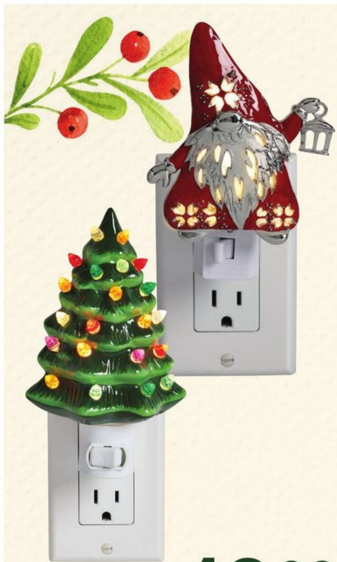
Ganz Holiday Night Lights, Select Styles