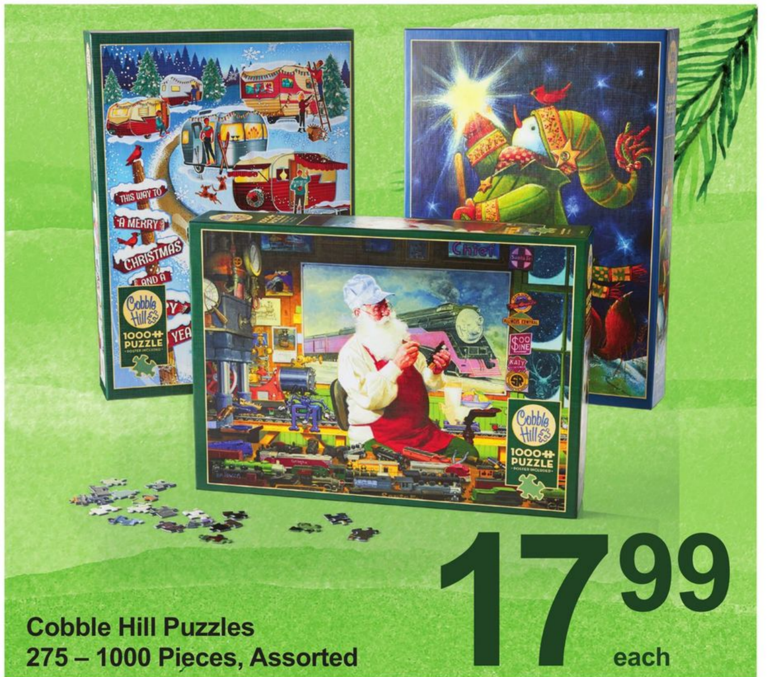
Cobble Hill Puzzles 275 - 1000 Pieces, Assorted