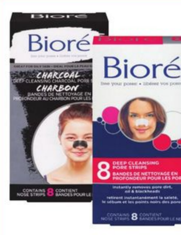
Bioré Face Care