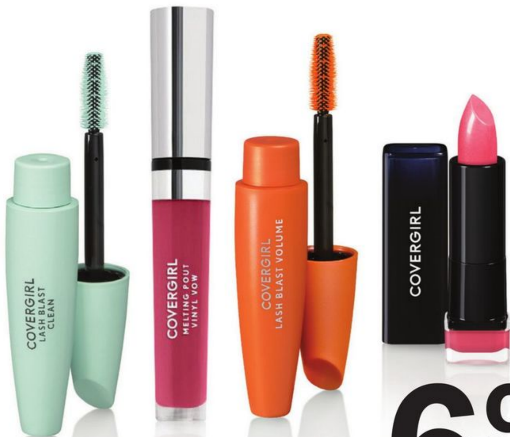
CoverGirl Lip or Eye Cosmetics, Select Types