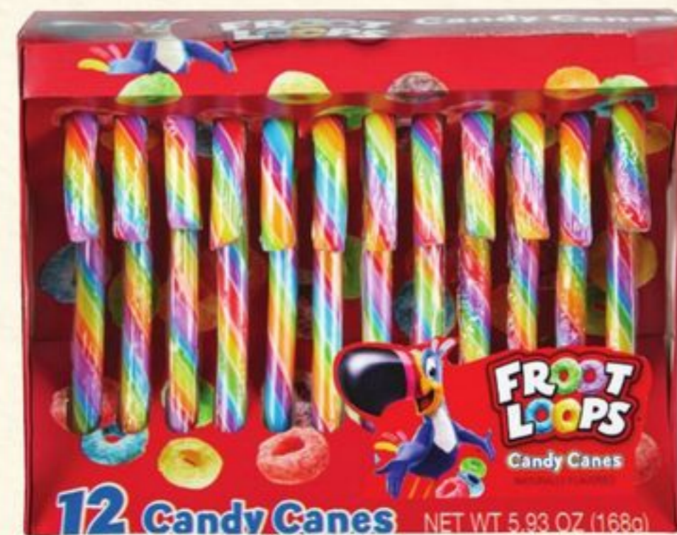
Licensed Canes 12's, Select Types