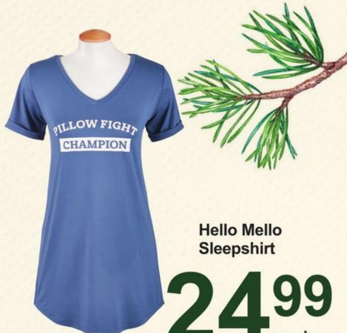
Hello Mello Sleepshirt