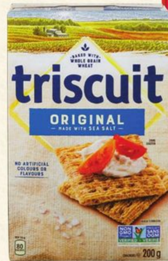
Christie Crackers 200 g