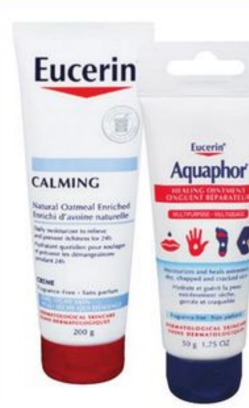
Eucerin Skin Care Products