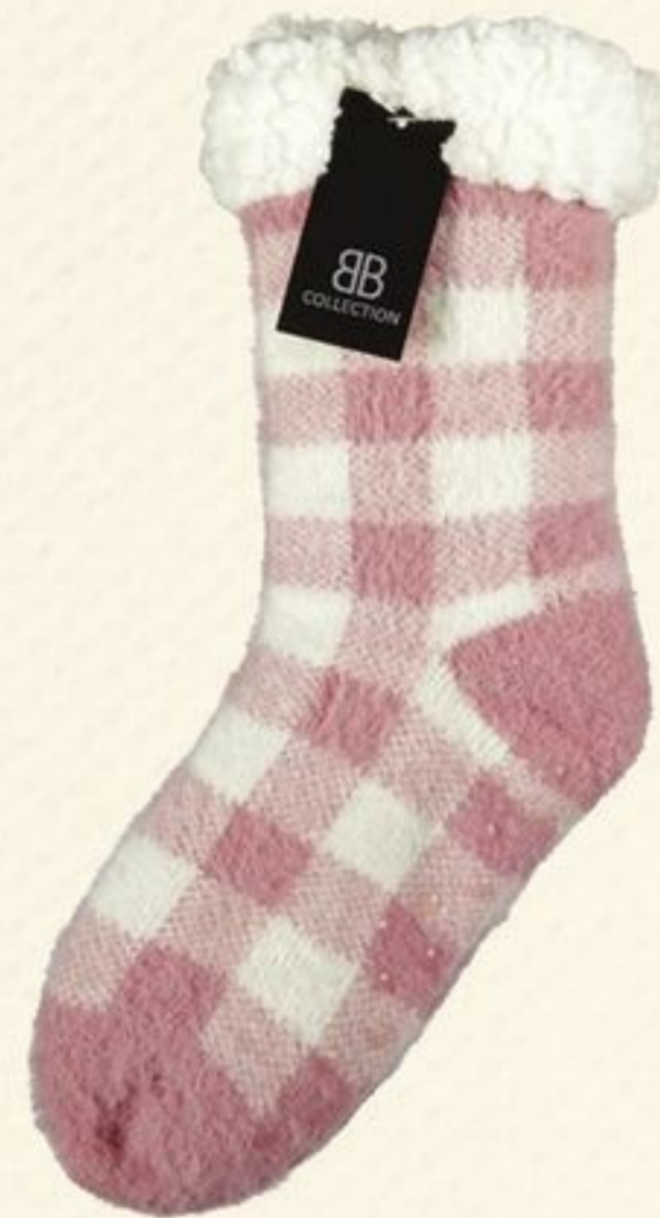
BB Collection Slipper Socks Pink Plaid 1 Pair