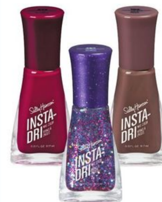
Sally Hansen Insta-Dri Nail Colour or Top Coat