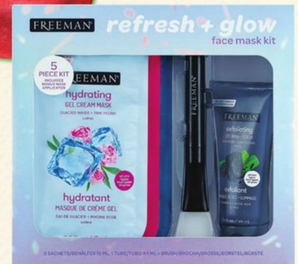
Freeman Refresh & Glow Mask Kit 5 Piece