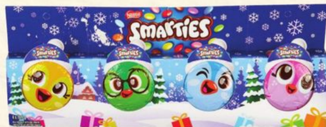
Smarties Mini Penguins Multipack 4 x 18.5 g