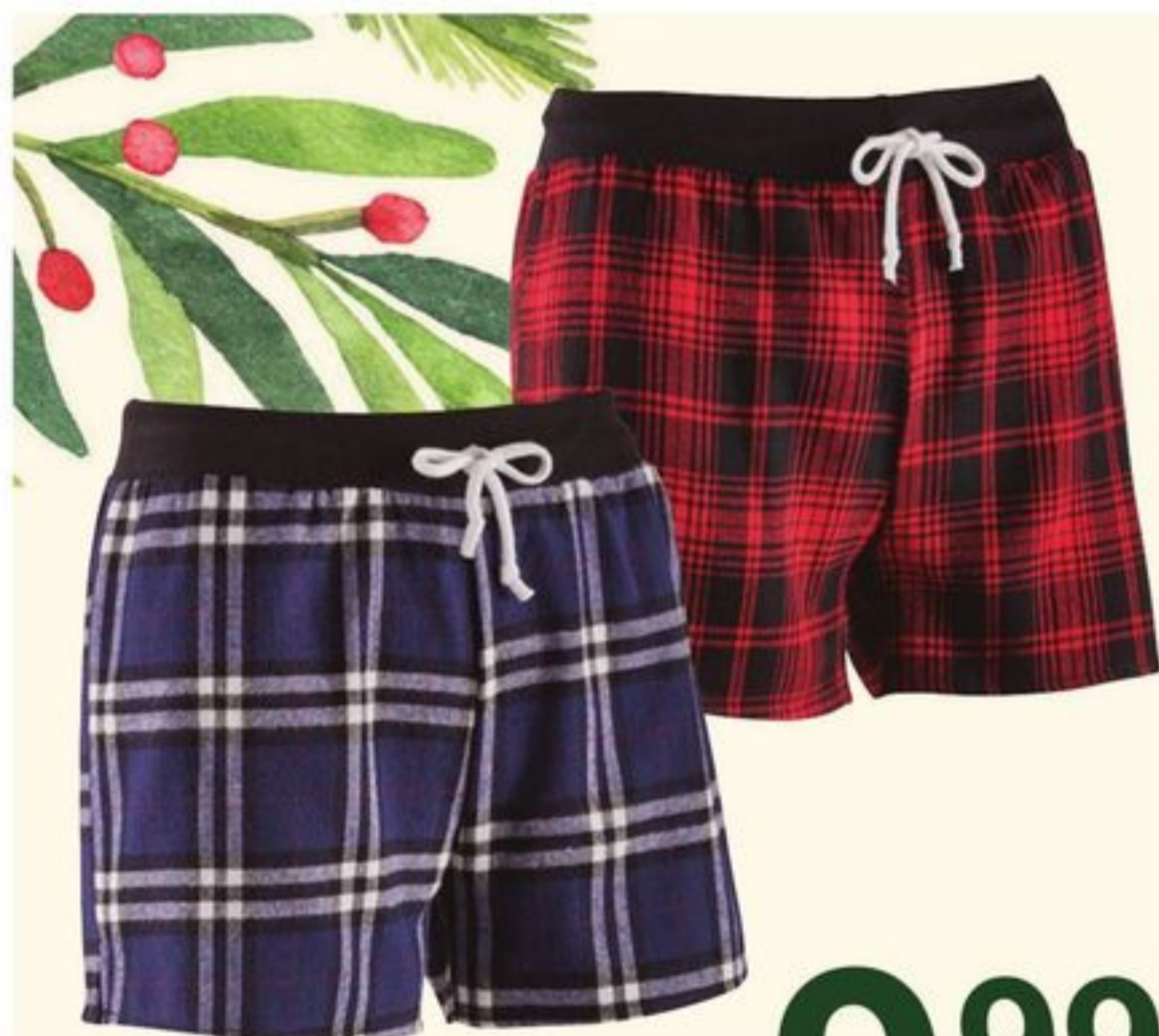
Cabin Collection Plaid Shorts