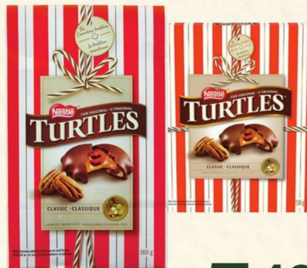
Turtles Gift Box or Share Bag 140 – 160 g