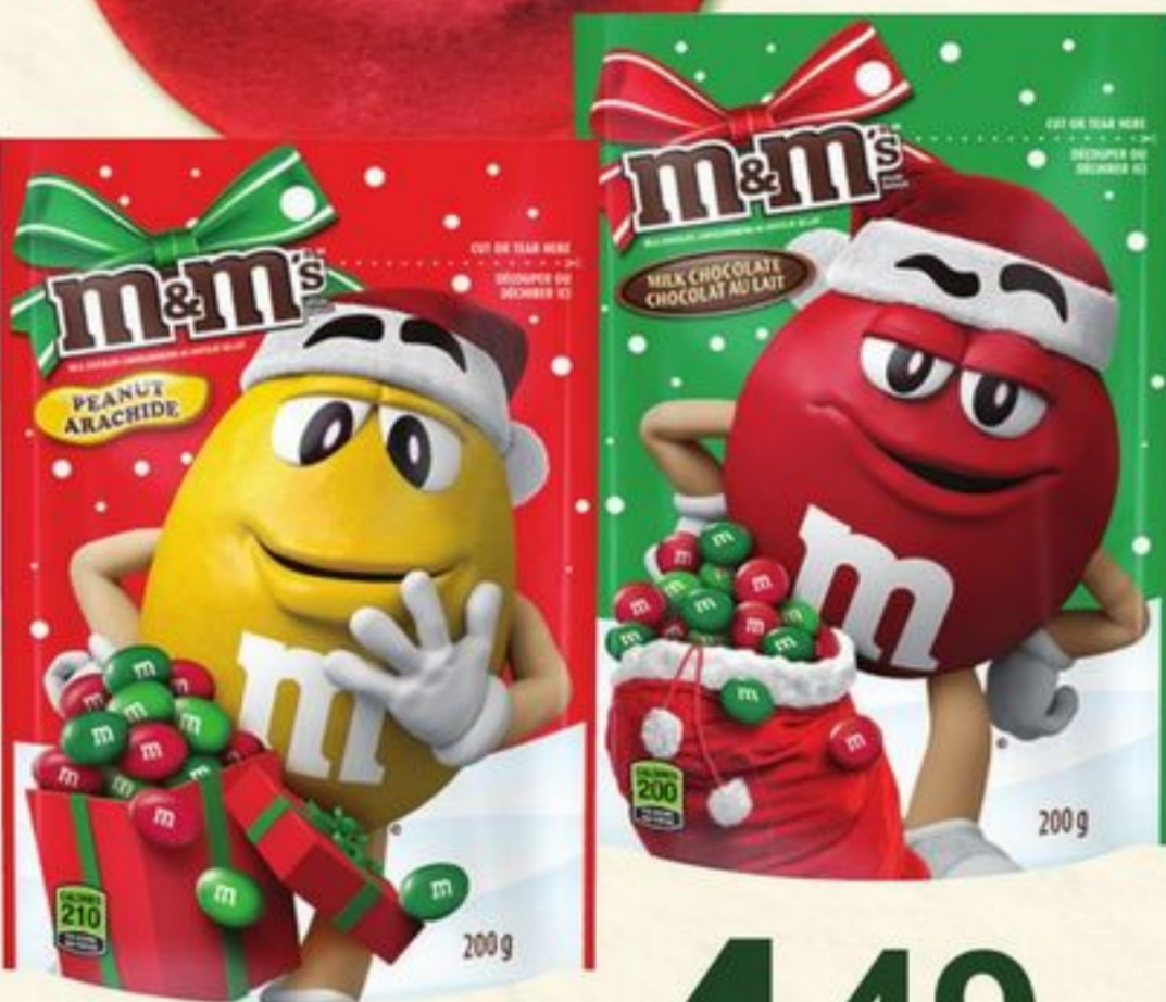
M & M's Pouch 176 – 200 g