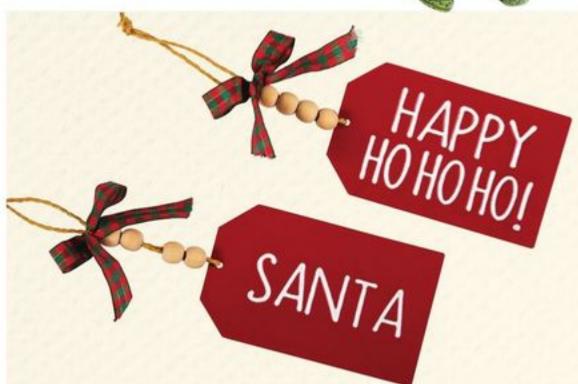
Ganz Red & White Text Tags with Plaid Ribbon, Assorted