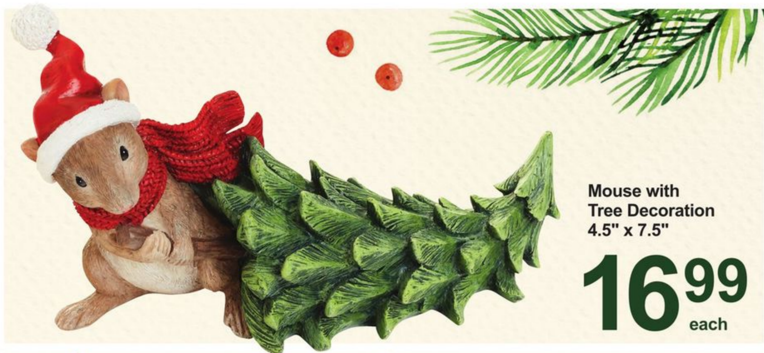
Mouse with Tree Decoration 4.5" x 7.5"