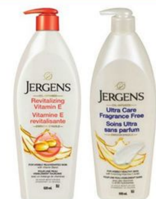
Jergens Moisturizer 620 mL