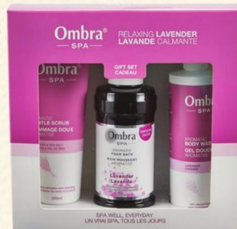
Ombra Spa Gift Set 3 Piece