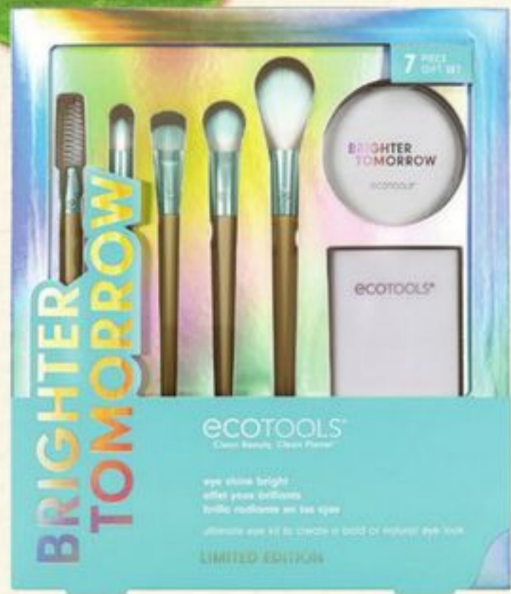
EcoTools Products, Assorted