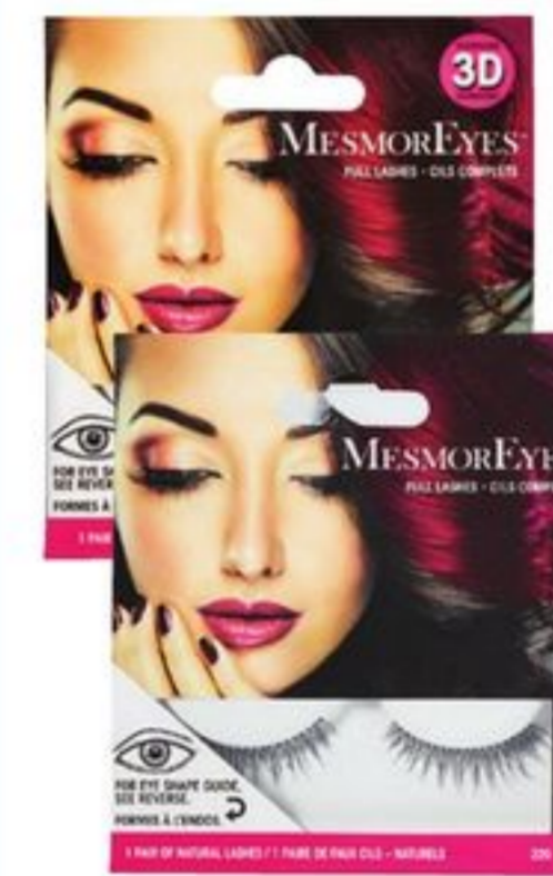
MesmorEyes Lashes, Adhesive or Adhesive Remover