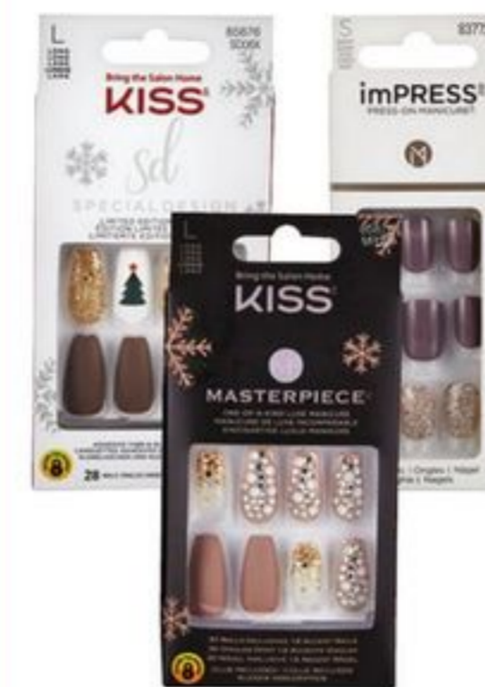
KISS Nail Products, Assorted