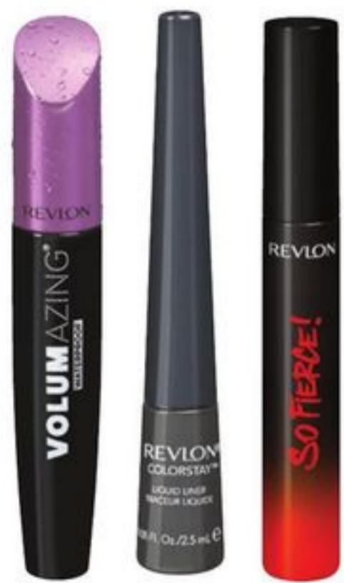
Revlon Mascara or Eyeliner, Select Types