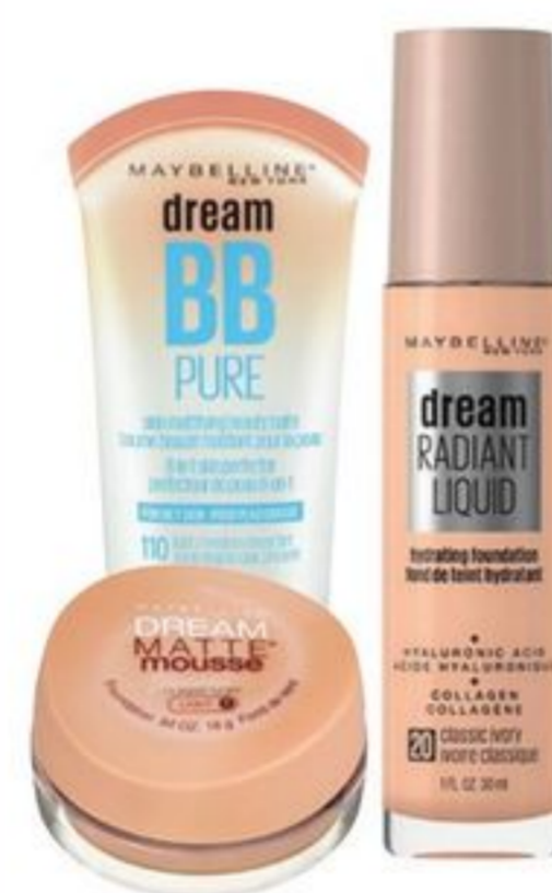
Maybelline New York Mineral Power Powder Foundation or Dream Products, Select Types